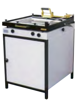
SPR-25 with stand option