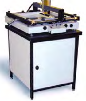
SPR-45 automatic printer with stand option

Model SPR-45 has the same features as the SPR-40, but is more automated with its power sweep squeegee and power frame lift for higher volume runs. Even for fine pitch applications, friendly precision controls make operation of these systems simple and easy.