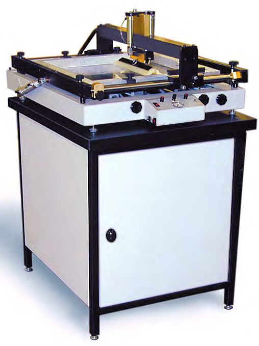
SPR-45 automatic stencil printer with stand option